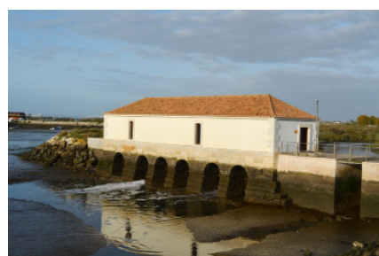
Moinho do Cais tide mill at Montijo, south of Lisbon

places and equipment in a good state of repair and open to the public. The day ended at the Cais tidemill (see picture) which was rehabilitated in 2005 and has four pairs of grindstones. On Sunday 10th November the participants went on a day-tour to visit three mills in Montijo: a tide, a wind and a tower mill we call “American metallic mill”, and one vertical wheeled