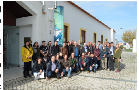
Participants of the 5th National Meeting assembled at the conference facility in Montijo; note the special banner!

a short video about mills in Montijo and went on to hear seven papers on various subjects connected to molinology. Lunchtime is always the occasion for networking, being with friends and buying the publications on sale. The afternoon had two parallel sessions, one about projects for the revitalization of mills or mill-related territories, and the other session was the presentation of thirteen papers. The session on projects is also a way to strengthen the bonds between the members of the Portuguese Mills Network, which is an informal group of mill owners and other stakeholders dedicated to keeping all kinds of grinding