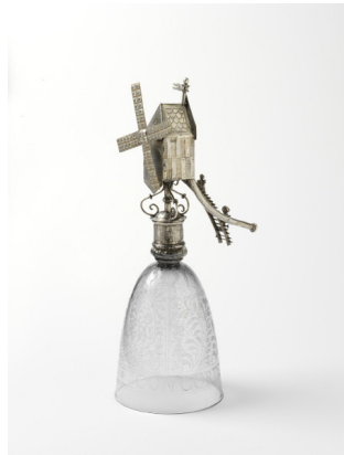
Glass goblet with silver post mill, front view

I found her story particularly delightful because I had just seen a version of this at the Victoria and Albert Museum in London. A top a ca. 1570 glass goblet is the most intricate, silver post mill ca. 1800. According to the museum's description, drinking games were popular in the 16th century in many European countries.