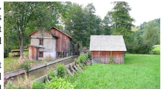
Corn and saw mill at Slovenj Gradec, one of the mills featured in the "Watermills in Slovenia" weblink

https://www.facebook.com/groups/427712580580461/ (watermills). This is a closed group and so one must have a Facebook account in order to look at the posts, as well as join the group.