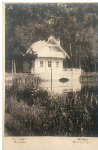
Watermill at Constantine Park in Strelna near Saint Petersburg, Russia. Postcard ca. 1900, coll. Ton Meesters

Strelna is a town near Saint Petersburg in Russia, on the Gulf of Finland. The "park" is Constantine Park, consisting of a big baroque palace built around 1720 in a symmetrical French garden looking out directly on to the Gulf of Finland, and surrounded by an English landscape garden.